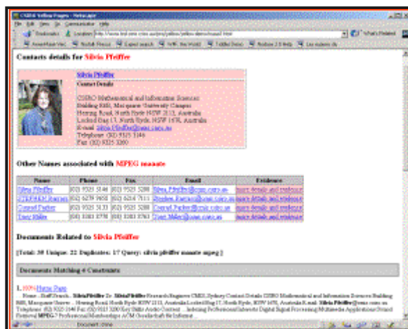
Fig.1. P@NOPTIC Expert results for the query "MPEG maaate", including details of the top ranked expert, a list of four experts and a list of supporting documents.

Figure 1. gives an example of P@NOPTIC expert search results. The current system lists up to 10 experts. The top ranked expert is presented with detailed contact information, a photo and a list of supporting documents. Other experts are listed with basic contact details and a link to supporting documents.